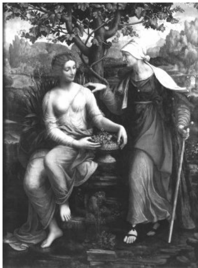
Pomona and Vertumnus Francesco Melzi 1517-20

Gather at 5 p.m. for ritual beginning at 5:30.